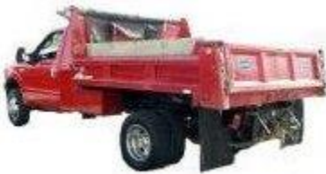
Image Search - An image can be used for the truck type search. The image can be any image, because the truck type search might be for an industry or service sector or body company, .... The image can be represented on any website page, even third-party websites.